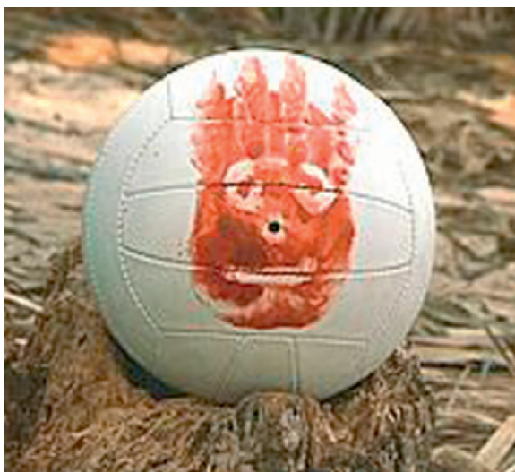
TRENDS in Cognitive Sciences

Social motivation thus appears to function like other basic homeostatic systems: relative deprivation gives rise to negative feelings that signal to the individual that her needs are not met, and a sophisticated psychological machinery is then triggered in an attempt to restore balance in the system (by increasing orientating, seeking, and maintaining behaviors).